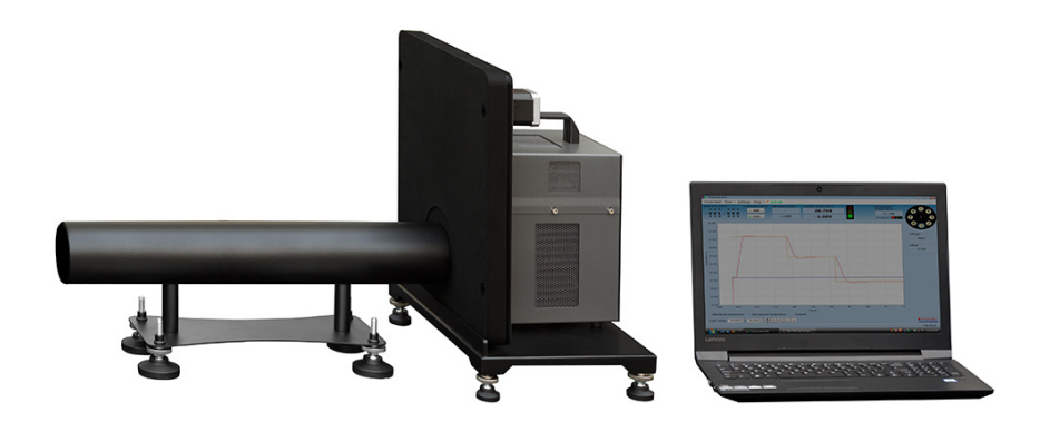
Fig. 1. Photo of the SAFT measuring set